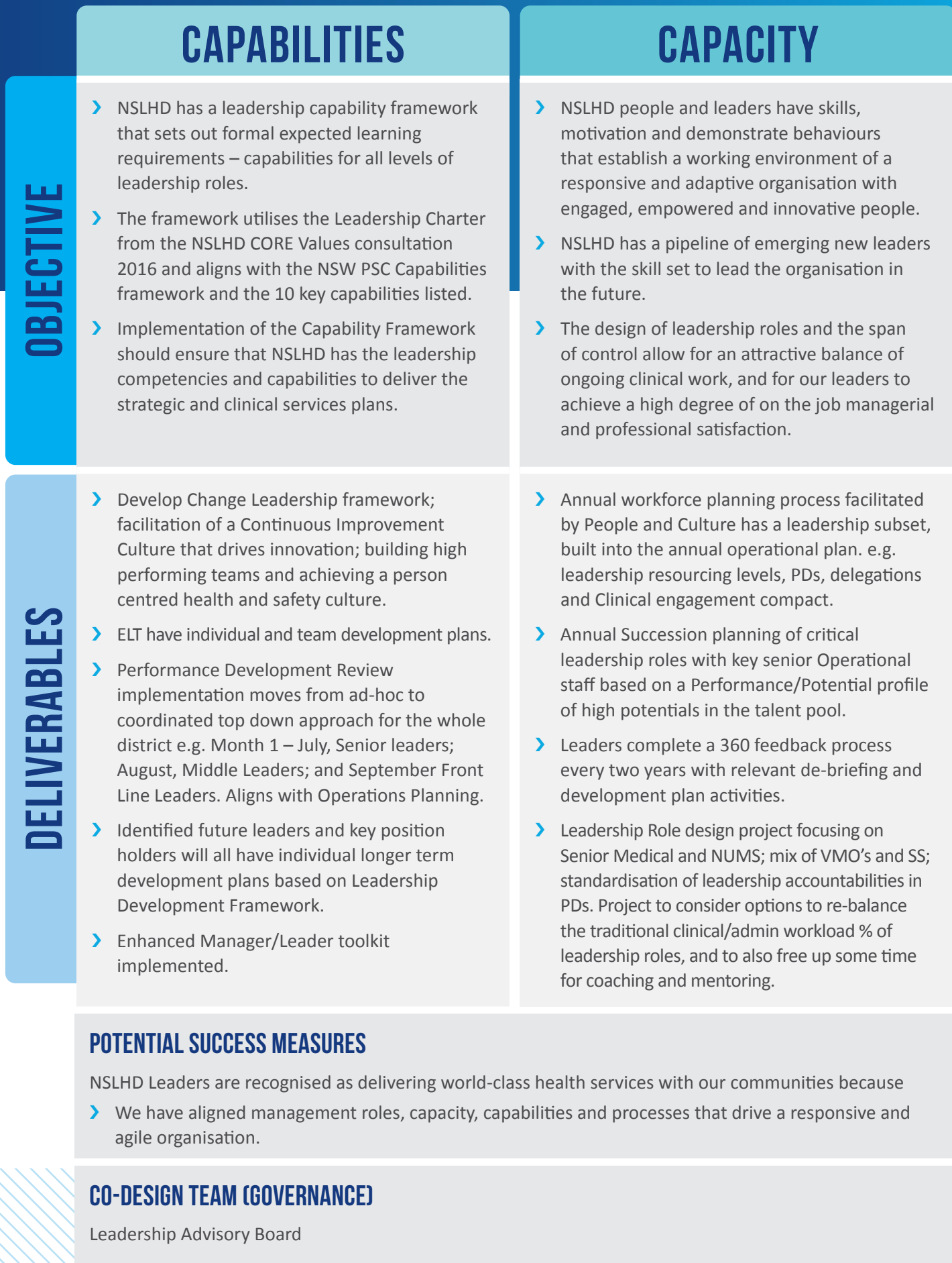
Figure 1. The Leadership Architecture for Northern Sydney Local Health District