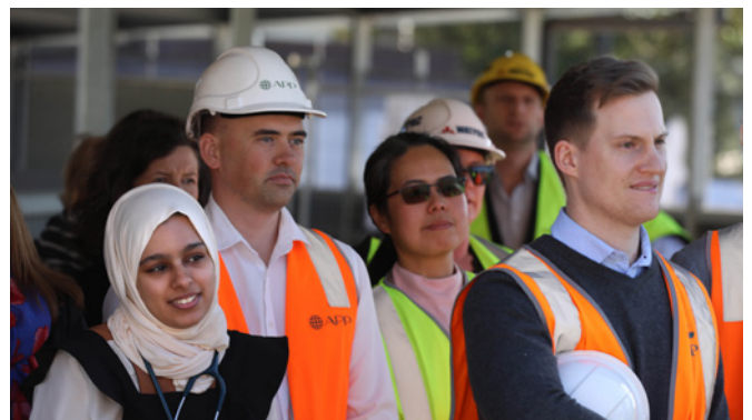
Staff and builders at the official sod turn