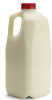
2L Milk = 2kg

Tip: Break up groceries or laundry into smaller loads by taking more frequent trips