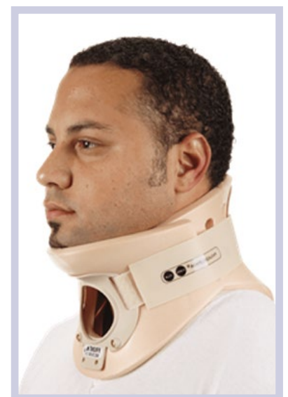
Philadelphia Collar: Images courtesy of Ossur Australia- Philadelphia Collar