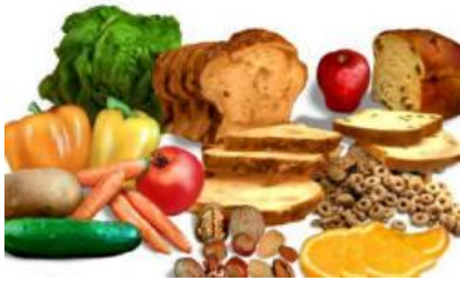
High Fibre Diet