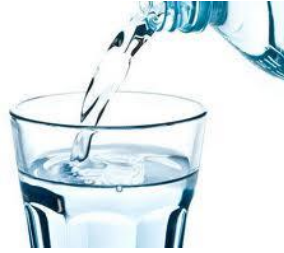
2-3 Litres per day